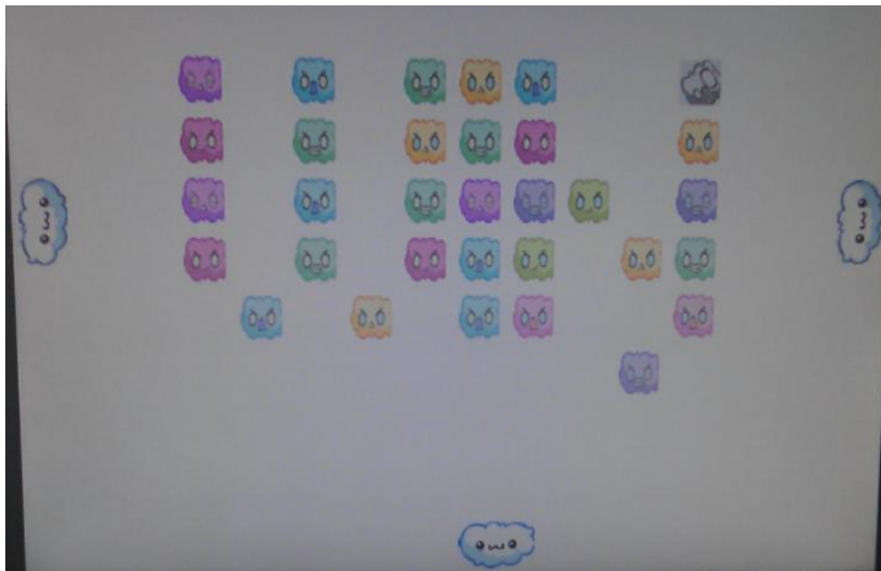
The display of the game when you when the game