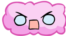
Pattern of the cloud-like brick

To make the game more complex and fun, the bouncing directions and speed are treated differently according to different incident angles. The structure of a cloud-like brick is shown in the following figure. Basically, we separate every brick into eight parts: four edges and four corners. When the ball moves along facing directly to any of the corners, it will reflect straight with the same horizontal and vertical mobility vector magnitude. Otherwise if the ball hits any of the edges or hits the corner in a un-direct way, it will retain its parallel mobility vector sign, and reverse the other one. Besides, each time when a brick is hit, it got erased and the mobility magnitude for both horizontal vector and vertical vector will be reset to one. This is designed to cooperate with the reflection rule of the board, which will be discussed later.